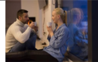
Looking after yourself when someone is dying Caring for someone when they are dying can be very difficult. While it can feel hard to think of much else, it's important to consider your own wellbeing too. Here you will find advice on how to look after yourself...