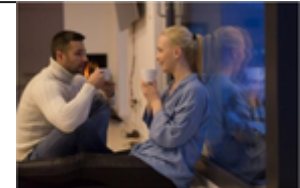
Looking after yourself when someone is dying Caring for someone when they are dying can be very difficult. While it can feel hard to think of such a time, it's important to consider your own wellbeing too. Here you will find advice on how to look after yourself... Hospice UK