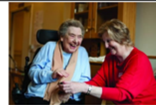
Caring for someone at home Caring for someone who is at the end of their life at home can be rewarding, but also very challenging. This page has advice for you if you are a carer.

Self-Care Matters - Understanding self-care