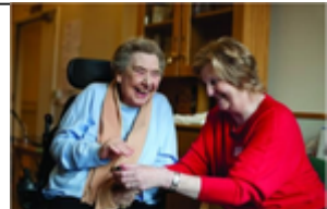
Caring for someone at home Caring for someone who is at the end of their life at home can be rewarding, but also very challenging. This page has advice for you if you are a carer. Hospice UK