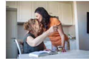
Talking about death and dying Talking about death to people you care about isn't easy. Find practical advice and on how to tell somebody that a loved one is dying, or has died.

SBAR-Implementation-and-Training-Guide.pdf (england.nhs.uk)