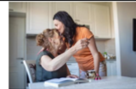
Talking about death and dying Talking about death to people you care about isn't easy. Find practical advice and resources to help you feel more confident about talking about death.

Let's talk about death and dying. | Age UK